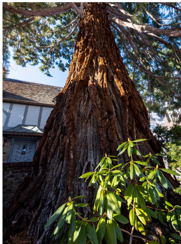
Nevada's Champion Sequoia.