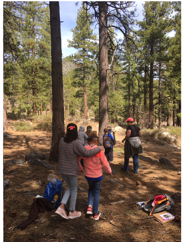
Sierra Nevada Journeys Classroom Unleashed Program 2019

Priority is given to programs that benefit underserved communities in the state of Nevada.