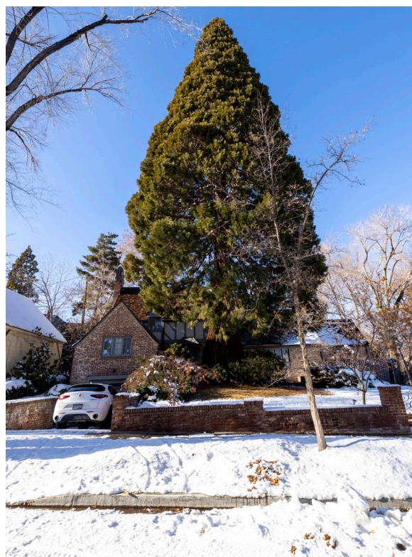
Nevada's Champion Sequoia.

Eligible projects must meet Federal and State Program objectives for Urban Forestry, as outlined in the Ten Year National Urban and Community Forestry Action Plan and/or the 2020 Nevada Forest, Range, and Watershed Action Plan . Generally speaking, projects that develop, strengthen, and expand urban canopies can be submitted for consideration.