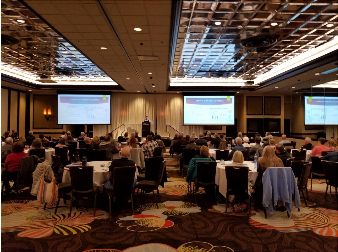
Chief Cupp highlighted the steps to become a more fire adapted community