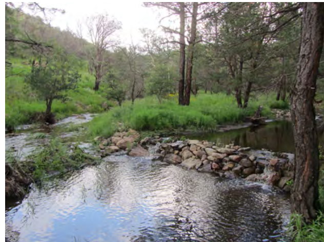
Turkey Creek in spring: In the arid Southwest, water is life.

Turkey Creek Canyon will protect 1,920 acres in a critical watershed of the Chiricahua Mountains in the Sky Islands Forest Legacy Area. The Sky Islands Region is named for forested mountain "islands" surrounded by desert & grassland plains, resulting in extraordinary biodiversity. Turkey Creek Canyon is home to four federally-listed fish, birds and mammals, and lies within a globally Important Bird Area of BirdLife International, the world's largest nature conservation partnership. One of only three perennial streams in the Chiricahuas, Turkey Creek is embraced by riparian forests of sycamore, cottonwood, and willow, and carries life-giving water across three miles of the property and miles beyond. The canyon slopes are cloaked in Madrean pine-oak woodland, leading up to the adjacent Coronado National Forest (CNF) and its Chiricahua Wilderness Area. For two decades, this property has been managed to enhance watershed conditions, wildlife habitat, and forest health with thousands of rock check-dams and gabions installed. This conservation easement project is an integral part of a landscape-level conservation strategies to restore watersheds, protect wildlife, and protect working lands from the threat of development.