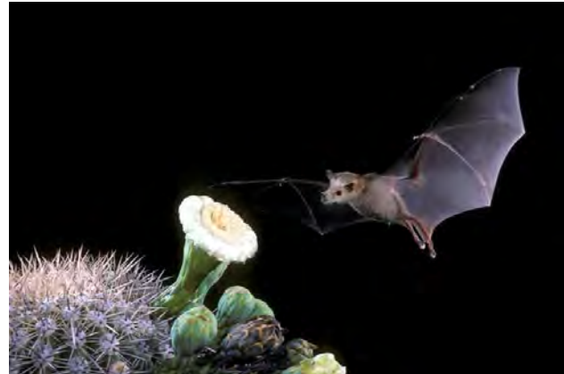
The endangered lesser long-nosed bat, a resident of Turkey Creek Canyon.