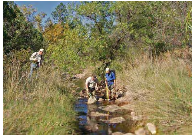
Endangered Fish Monitoring by USFWS, AZ Game & Fish, & the University of Arizona