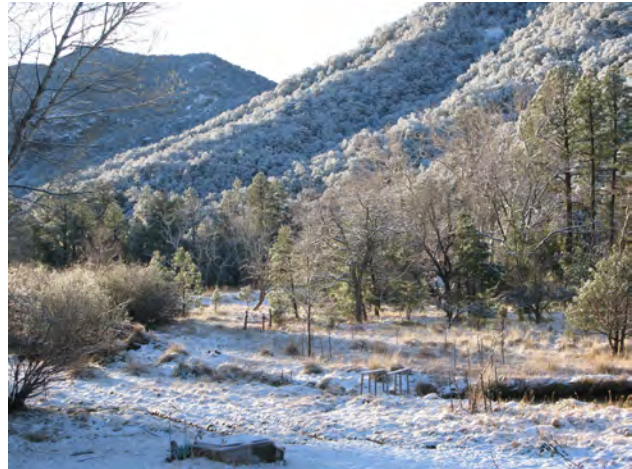
Turkey Creek Canyon covered by the first snow of winter.